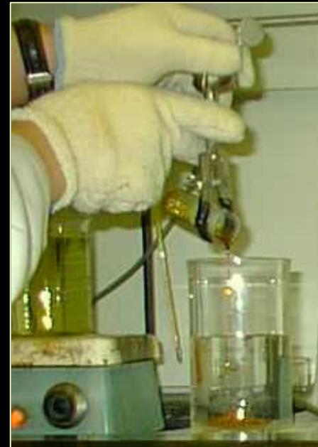
Pouring Molten Sulfur into Cold Water - Amorphous