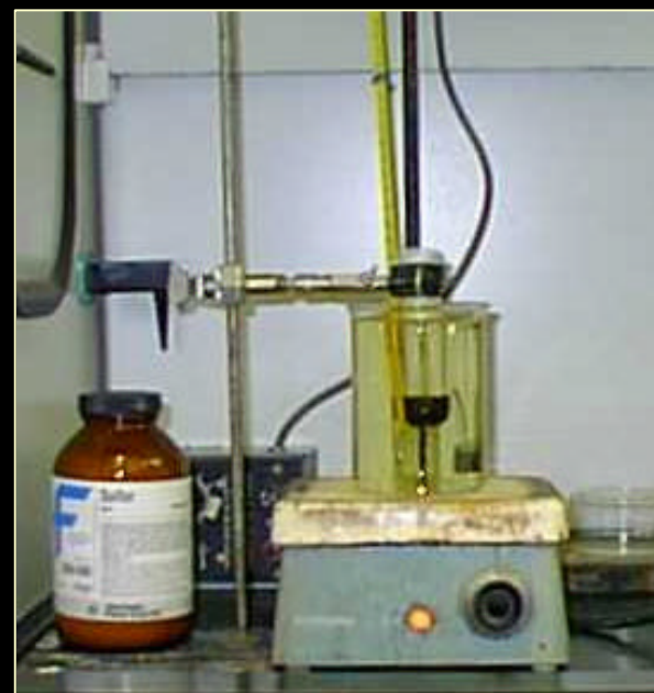
Melting Sulfur in Oil Bath